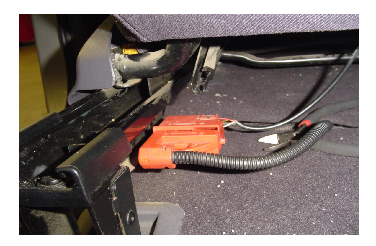
(2) Switch off ignition. Unclip OSRS connector